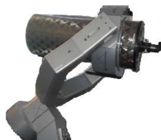
Optical Guidance Systems Ritchey-Chretien Telescope To learn more, see: www.opticalguidancesystems.com