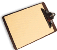
AAVSO Members log thousands of observations