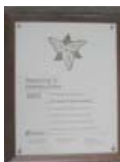
The Ontario Trillium Foundation Plaque at the observatory

The plaque says: "Investing in Communities 2003. The Province of Ontario and The Ontario Trillium Foundation are proud contributors to building healthy, caring and economically strong communities by supporting projects that improve the quality of life." It includes the names of the Premier, Minister of Culture, and Chair